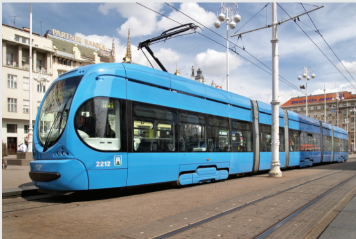
"Končar" tram vehicle in Zagreb

Remote diagnostic functions allow monitoring of all intelligent units from one connection point.