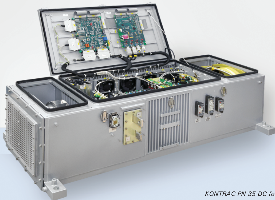
KONTRAC PN 35 DC for trams

KONTRAC PN 35 DC is used as the auxiliary power supply converter in tram vehicles. It converts 600 V DC or 750 V DC line voltage into three-phase AC voltage intended for supplying of tramcar's air-conditioning unit, single-phase AC voltage for service purposes and DC voltage intended for charging batteries and supplying of all DC consumers onboard the tram.