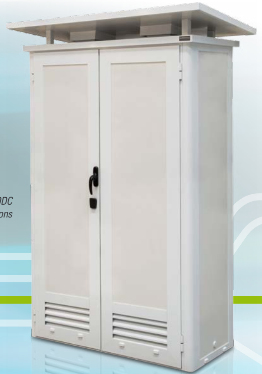
KONTRAC PN100DC for substations

KONTRAC PN50DC / PN100DC is a trackside auxiliary power supply converter fed by 3 kV DC overhead line. It is used in order to supply various loads inside the substation facilities (power supply for integrated lighting and information systems, railway signaling and protection systems, etc.). Overhead line might generate spikes, sags and surges caused by the current drawn from locomotives. Those are likely to damage the input stages of conventional converters.