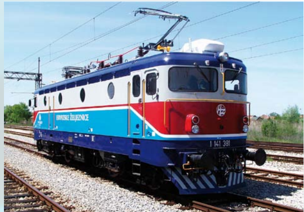
Thyristorized Bo' Bo' locomotive for Croatian Railways