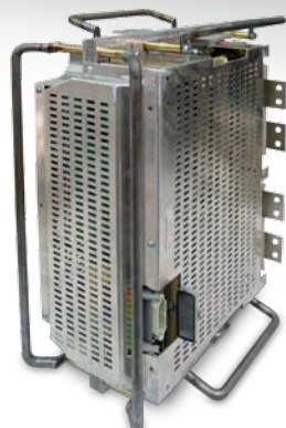
Converter power unit