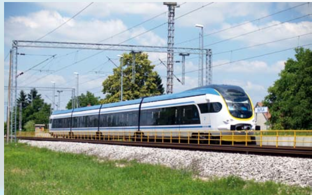
KONČAR electric multiple unit for Croatian Railways