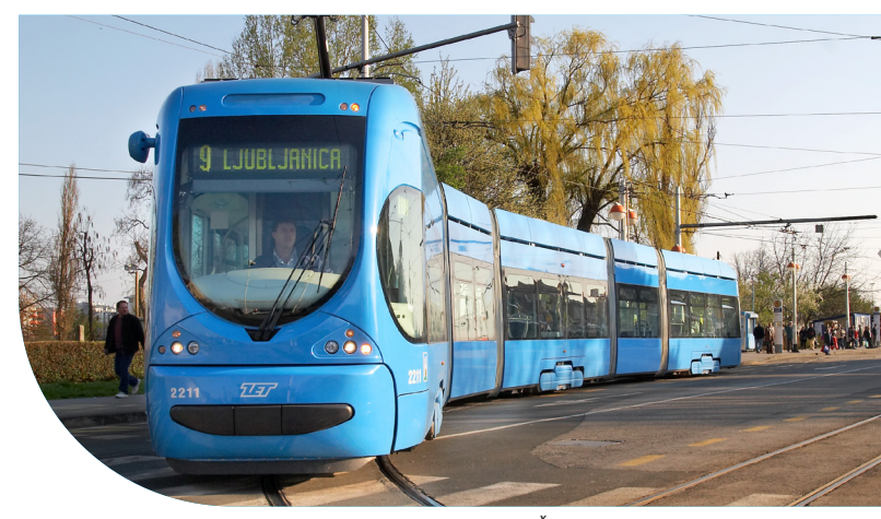
KONČAR tramway vehicle in Zagreb