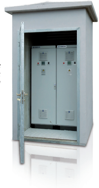
Two converters KONTRAC PN30AC installed in Drivenik Railway Station, Croatia